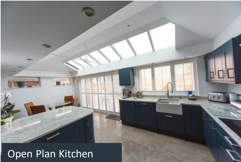
Open Plan Kitchen